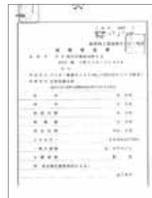
④ Serological test