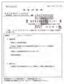
① Acute toxicity test

Long range intake of Bio-Normalizer showed no significant changes in the liver functions (SGOT, SGPT) indicating that Bio-Normalizer does no harm the liver of healthy people.