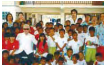
For AIDS children (THAI) Hospice for AIDS patients