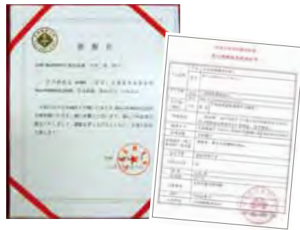
For SARS (CHINA) Letter of appreciation from Tianjin Medical University and certification as immune modulator health food by the Chinese Ministry of Health.