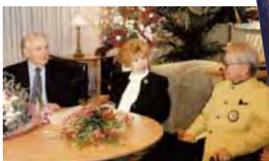
The former Russian President Gorbachev and Mrs. Raisa Gorbachev acknowledged the dramatic result of humanitarian mission given to the victims exposed to radiation during the Chernobyl Nuclear Plant accident and this event was held at the Hotel in Gifu City, Japan.