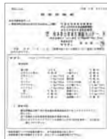
③ Quantitative analysis of heavy metals and harmful compounds