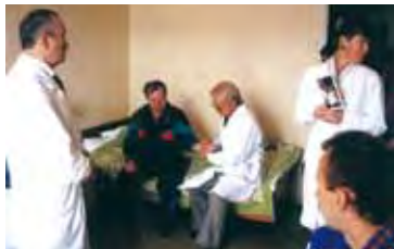
For Chernobyl liquidator (Russia) The exposure accident of Chernobyl nuclear plant