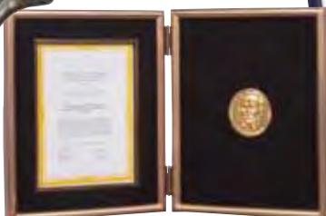
Metchnikoff Certificate and Medal