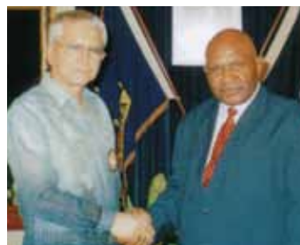
His Excellency Sir Silas Atopare, Former Governor General of the Independent State of Papua New Guinea.