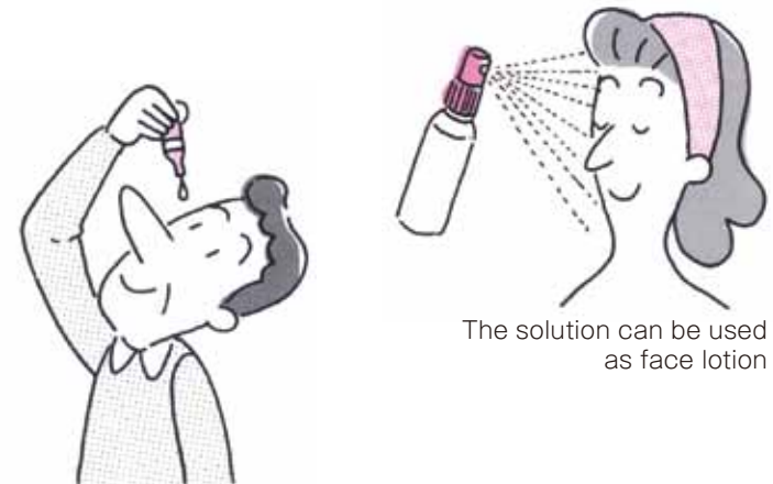
The solution can be used as face lotion