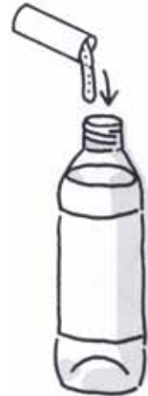
0.5g with 500 ml of water

Solution should be used within the day of preparation. Effectiveness of concentration varies from person to person. One has to find his or her own effective dose.